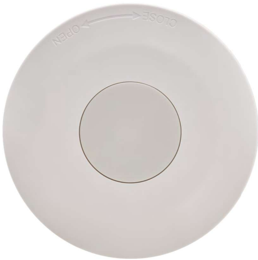
Cut Out Ø76mm (Recessed Mount)